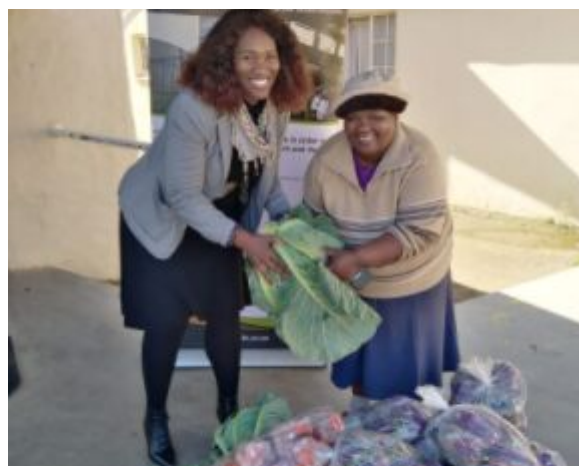
The centre received food parcels